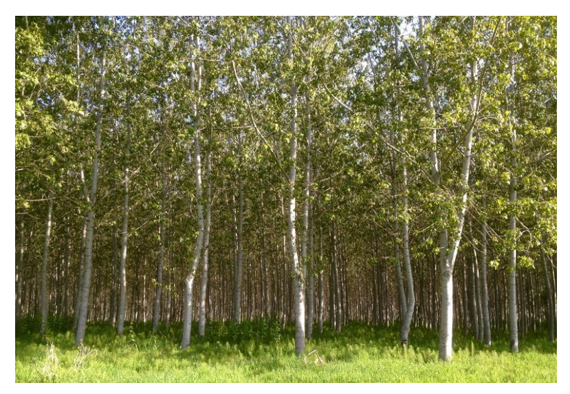
A plantation of P. trichocarpa

A notable exception is that this study identified two related genes in trees that Brunner and others had previously characterized from Populus . The FT1 gene was known to regulate the transition to flowering and FT2 is important for controlling fall growth cessation and bud set. Besides, the study has identified more than 17 million SNPs (Single Nucleotide Polymorphism). These polymorphisms revealed significant spatial and geographic structure, even at fine spatial scales.